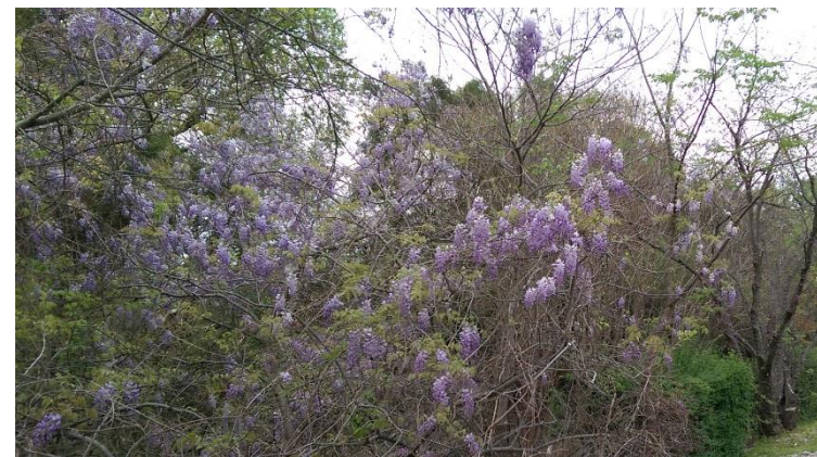
Wisteria in bloom along the Katy