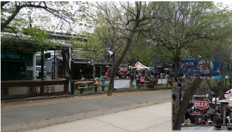
An outdoor eating establishment serving a quintessential runner's beverage or two...