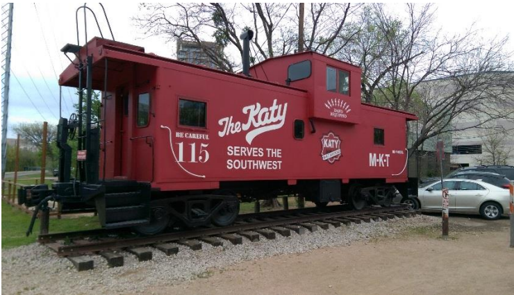
The Katy caboose: evidence there was a rail line that split Dallas at one time

If you ever plan to go to downtown Dallas, make sure to take your running shoes. The Katy is worth your time!