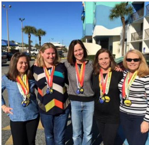
Tybee Island Marathon Weekend

She loves running and racing long distances and says "My favorite race for 2015 was the PTC Classic 20k, and I'm not just saying that to be nice. I really enjoyed the Classic Challenge because it was a challenge for me. The whole 'run fast and long' is so different from how I train. I pushed myself out of my comfort zone and LOVED it!!"