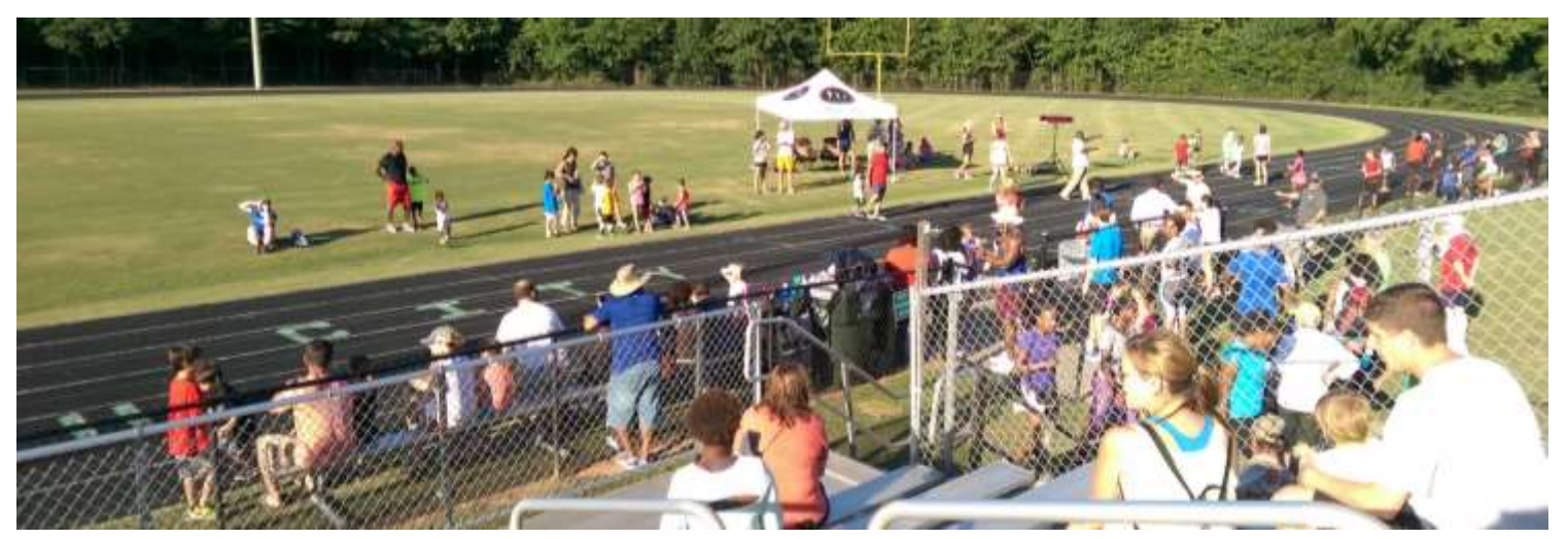
Peachtree City Running Club Summer Track Series Underway