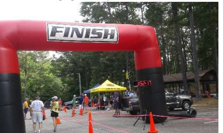
Marathon Relay Finish

I am soon drafted into assisting the voting for the best team name. I wander through the runners to ensure each one votes. The names all are hilarious! Ranging from my favorite, "Worst Pace Scenario" to "I thought they said Rum,"