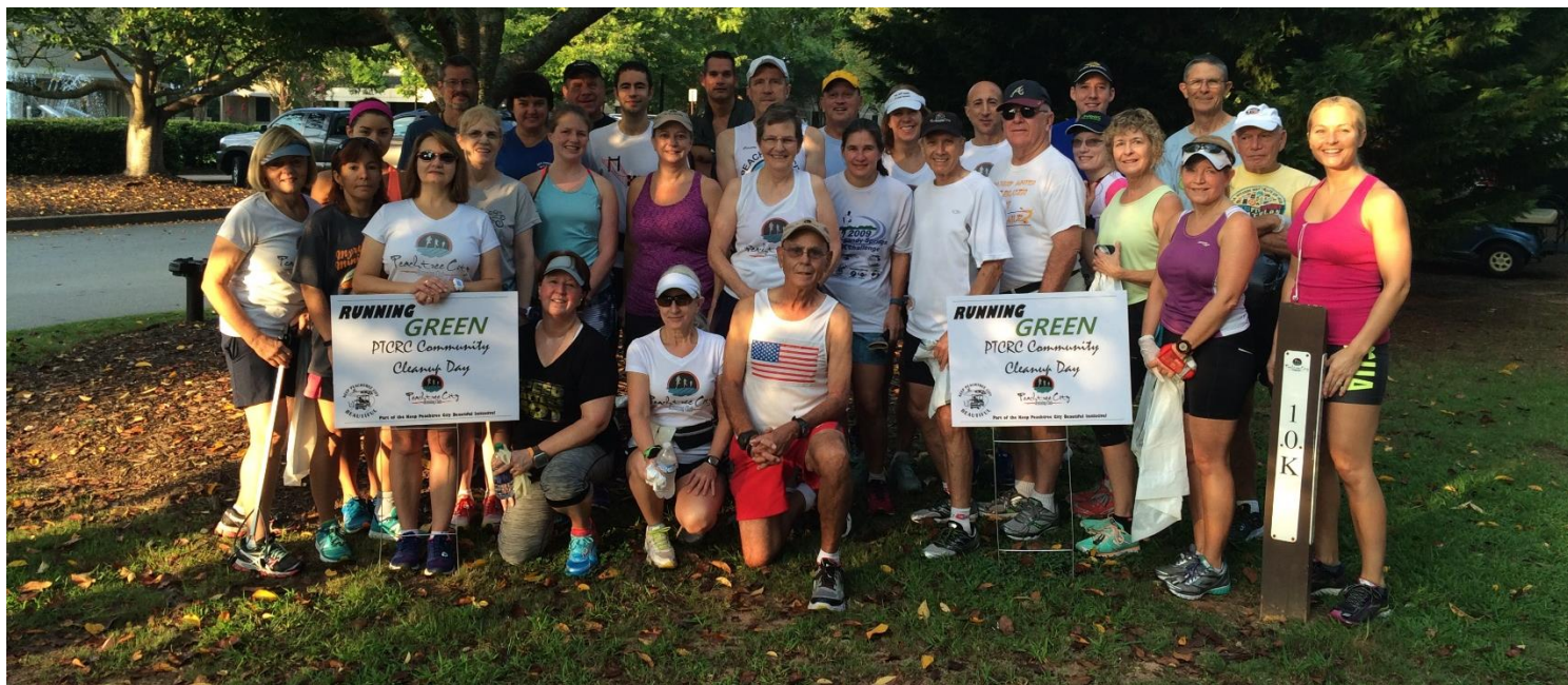
Peachtree City Running Club Members Picking UP Litter on the 10k Course

Many thanks to all the volunteers who came out to pick up trash; we appreciate your help and dedication to the Club and our community.