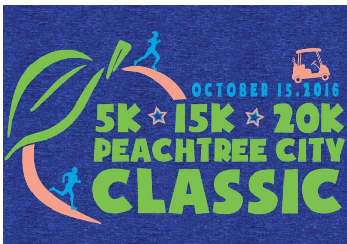
2016 Classic Race Shirt Design