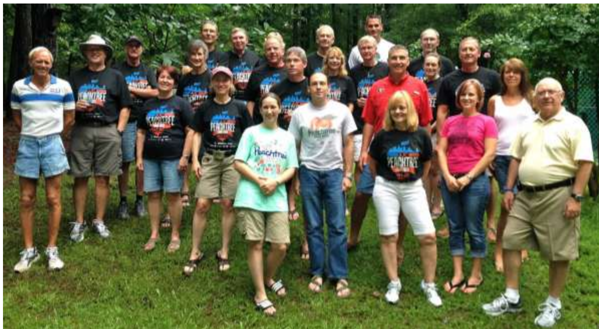
Club Members at the Fourth of July Picnic, post Peachtree Road Race