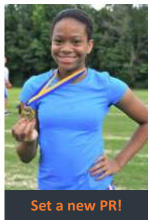
Set a new PR!