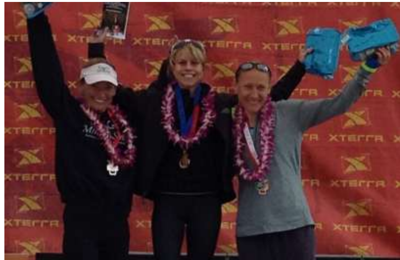
On the awards stand!

For some history on my involvement with XTERRA, after I ran my first XTERRA Trail Race, XTERRA Deep South 15K in Jackson, GA last June, the