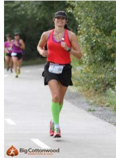
The good race photo

The altitude was kicking my butt, my hip hurt and by now (mile 17) I could feel serious quad fatigue. I went into the race knowing altitude might be a factor but had no way to know how much of one it would be. I made a quick decision to calm down, stop racing and just enjoy it. I was in a beautiful place, surrounded by mountains and fall foliage. Maybe I wasn't going to BQ this race, after all. Maybe this was a race for me to learn from and make memories with. I started to wrap my brain around this and continued to the finish. For the first time ever, I meandered through the water stations. I said "hi" and "thank you" to the volunteers. I high-fived kids who were cheering on the runners. I actually got a good race photo! I even stopped at a Physical Therapy tent and put some biofreeze on my hip and quads. In the end, I finished in 4:29, a full 35 minutes off my marathon PR. I was okay with that (trying to be okay, at least).