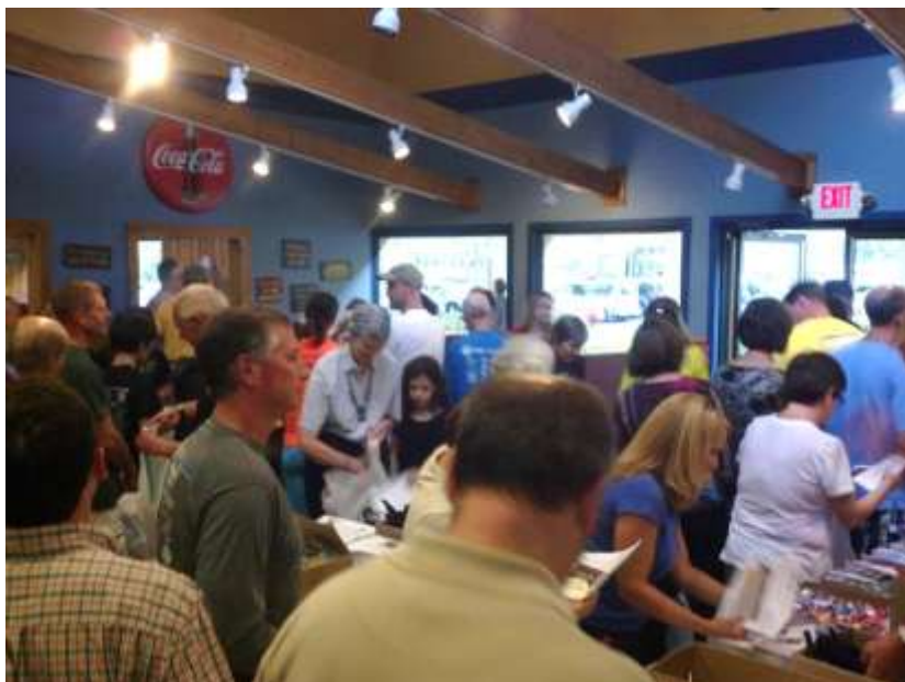
Classic 5k/15k Packet Stuffing at Partners Pizza