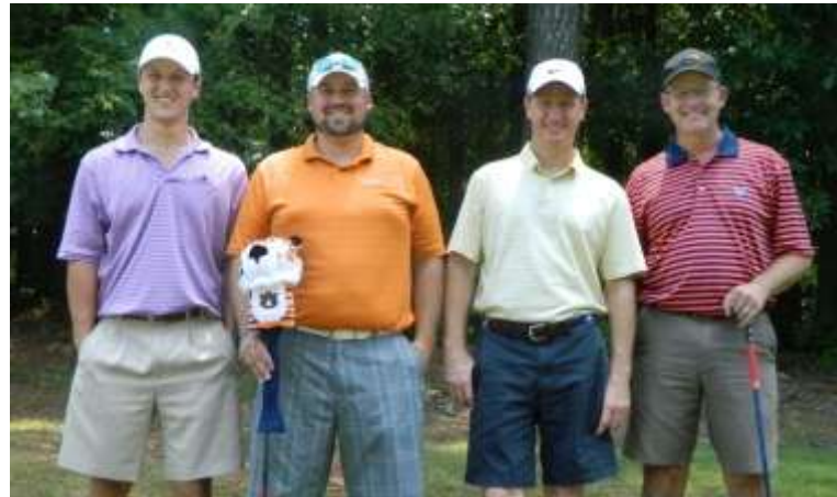
Team Orange Crush