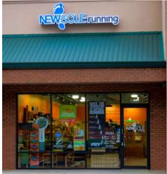
NEWSole Running Store