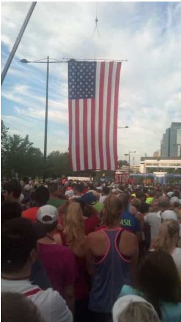
Peachtree Start under Old Glory