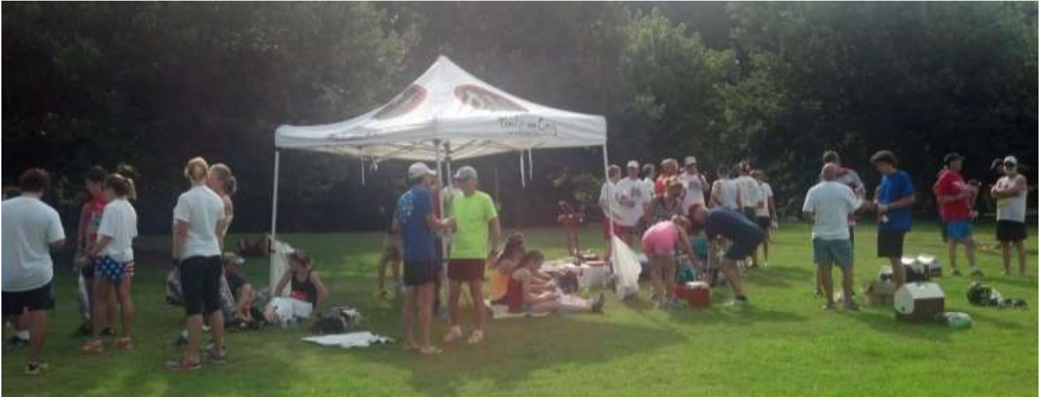
Club Tent at Peachtree