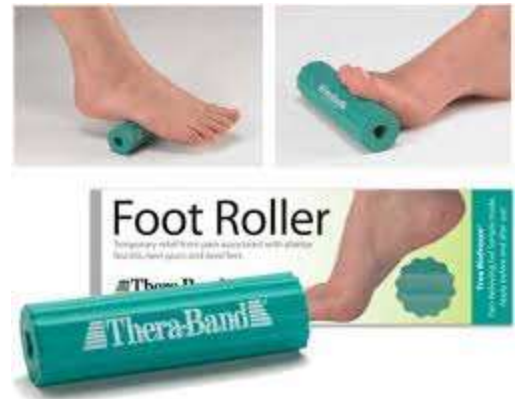
Thera-Band Foot Roller

He enjoys running as well as helping competitive and recreational runners get back to running without pain.