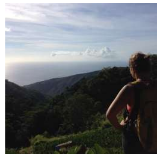
Jennifer at a mountain overlook

Jennifer has had a wide variety of running adventures and experiences but one that stands out is when she "participated in the Nature Island